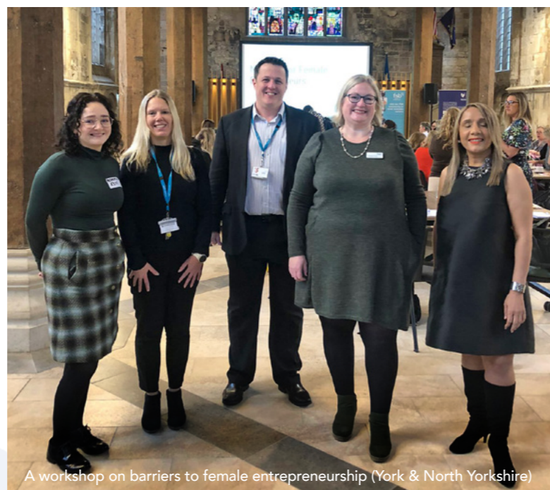
A workshop on barriers to female entrepreneurship (York & North Yorkshire)

The deepening of devolution across our region presents a unique opportunity to co-create evidence-based policies that bring real benefits to communities.