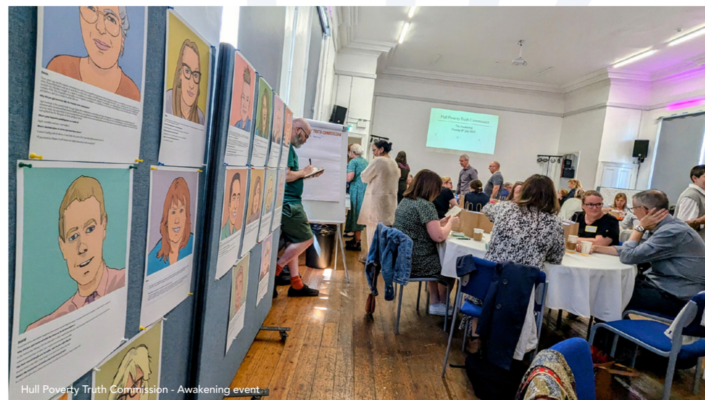
Hull Poverty Truth Commission - Awakening event

Extending the work begun by Y-PERN, the Yorkshire & Humber Policy Innovation Partnership (YPIP) has been awarded £5 million in UK Research and Innovation (UKRI) funding (from ESRC, AHRC and Innovate UK) as the only Local Innovation Partnership (LPIP) of its kind in England. It brings researchers from every Yorkshire university together with policy, business and community stakeholders – prioritizing those from marginalised communities – to carry out innovative research addressing three key themes: inclusive growth, sustainable living and data analytics.